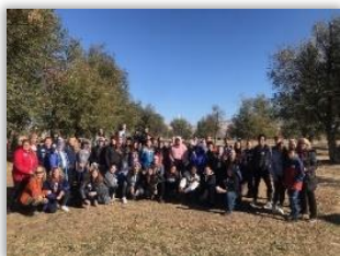
PTSA Leadership Conference at Willow Park