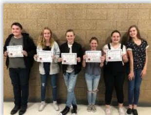
PTSA 2019-2020 Board